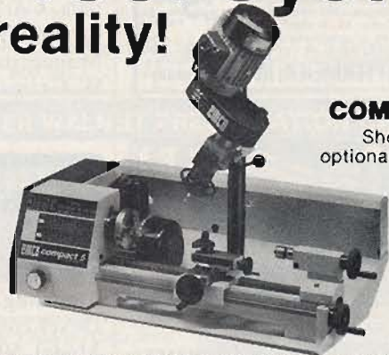
COMPACT 5 Shown with optional accessories

For the more demanding hobbyist or professional, the Compact 5 lathe is designed with the precision and accuracy of larger industrial lathes. The cast bed is extremely resistant to vibration and twist. With optional accessories the Compact 5 also converts to a universal machine tool with the added capabilities of thread cutting, milling, drilling, gear cutting, and vertical boring. The basic lathe is $795.00.