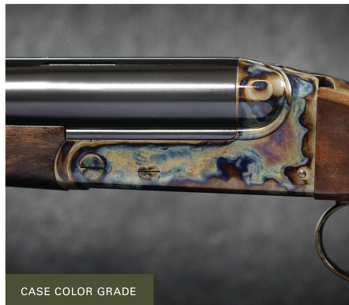
CASE COLOR GRADE