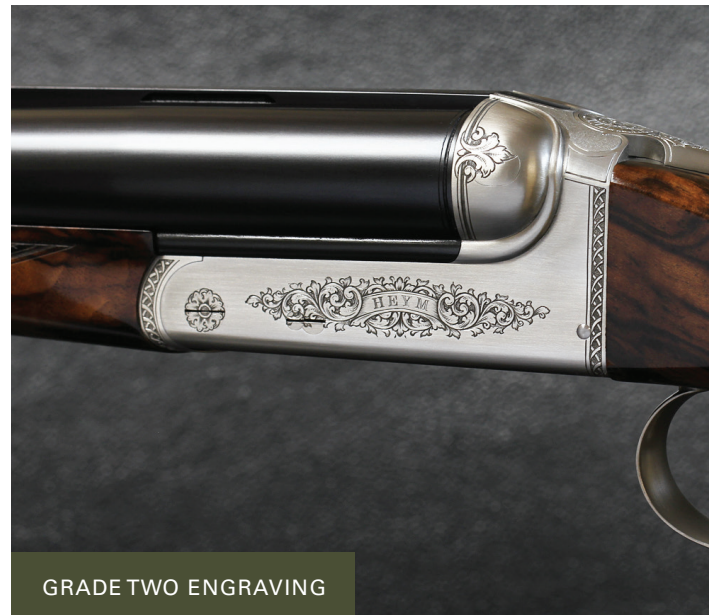
GRADE TWO ENGRAVING

Built on the legacy and reliability of the model 88B, the 89B is a tribute to a bygone era in English gunmaking history. Its classic lines incorporate the best design elements of pre-war, British, boxlocks, while modern steels and precision machining capabilities provide the most in strength and reliability.