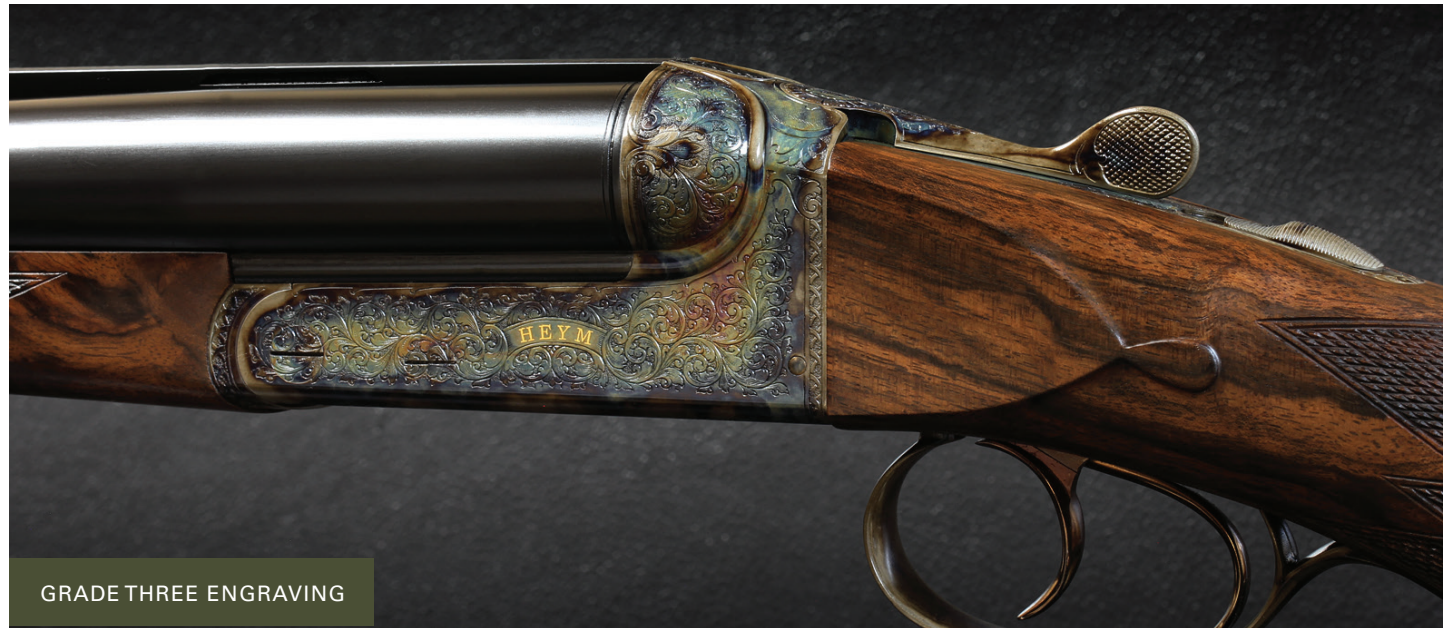
GRADE THREE ENGRAVING