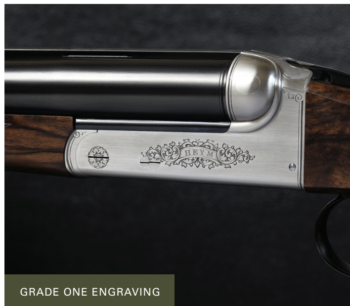
GRADE ONE ENGRAVING