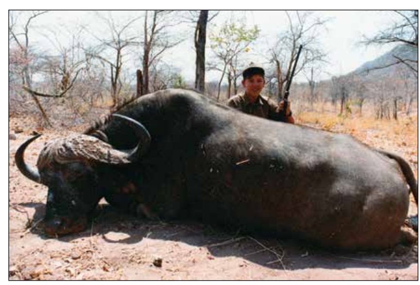
Cape Buffalo, 1992